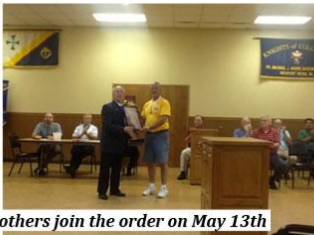
Congratulations! Four Brothers join the order on May 13th